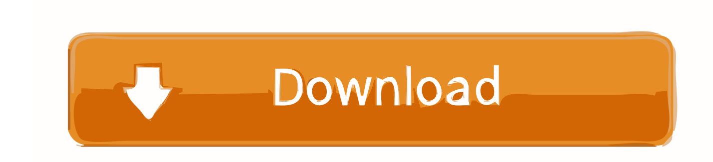
Dmde 2 4 Keygen Crack